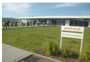
Study visit to Freiburg and Colmar April 2014